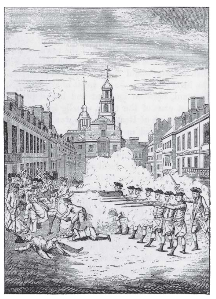
Boston Massacre. From an Engraving by Paul Revere.