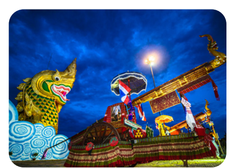
There is a big lantern festival every year.