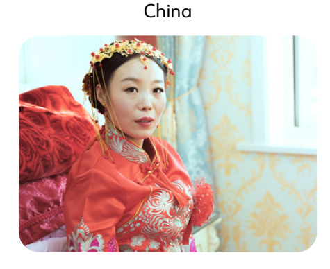
Brides usually wear red wedding dresses.