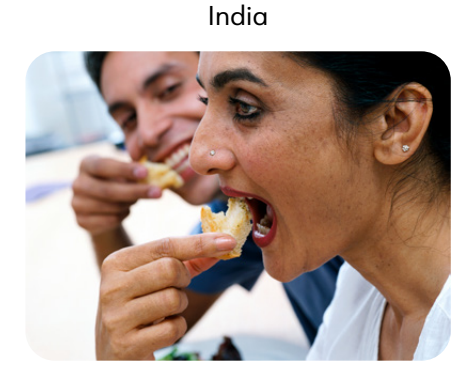
People eat food with their right hand.