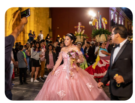
Many girls have special 15th birthday parties.