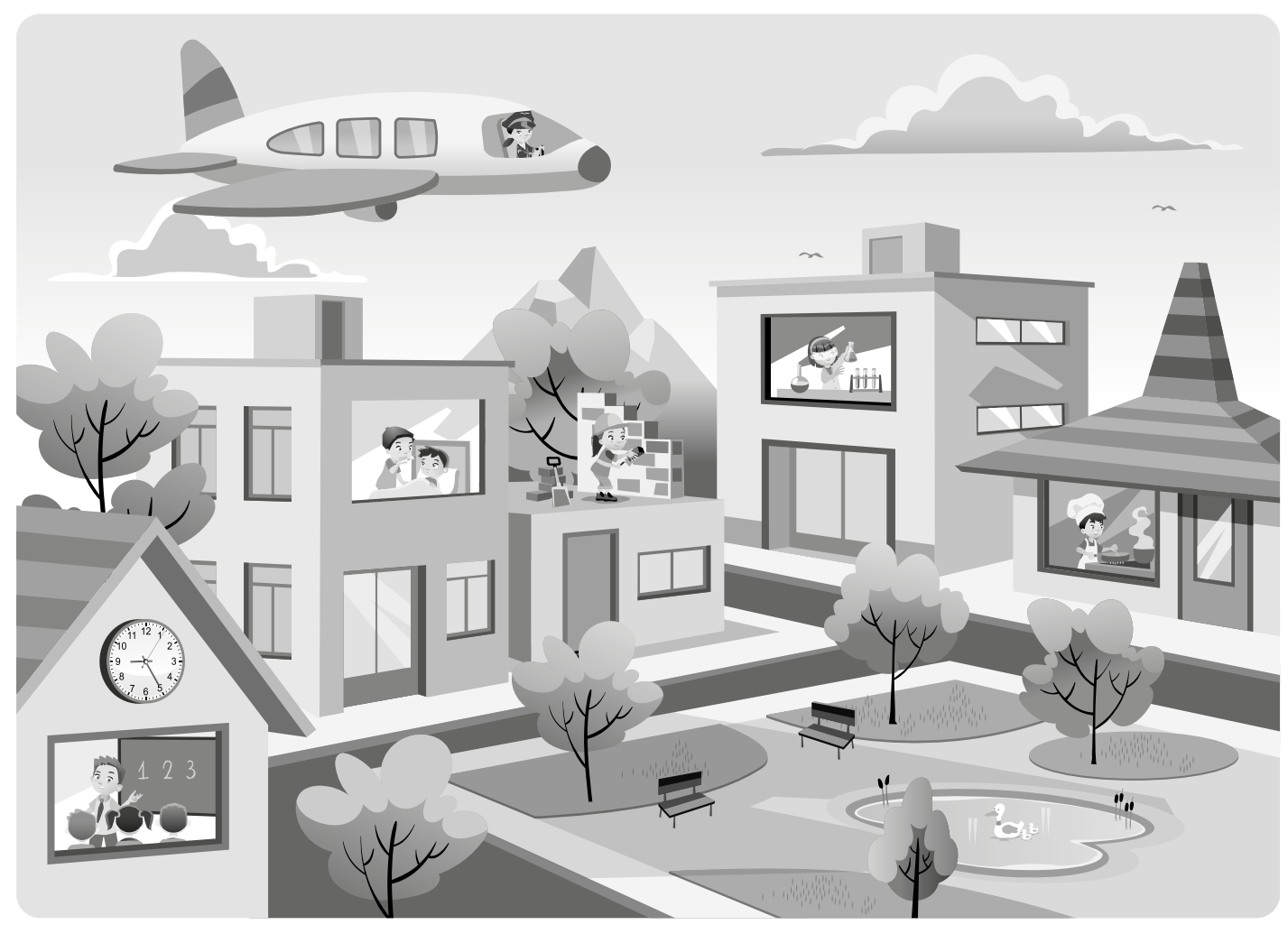
2 of 4