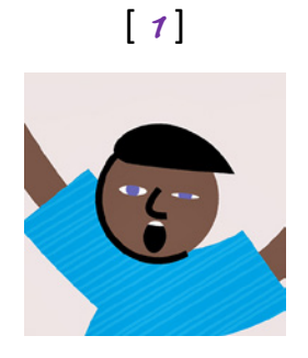
I get up.