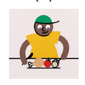
I eat my dinner.