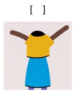
I get dressed.

3 Number the pictures to show your daily routine.