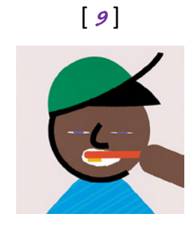
I get ready for bed.