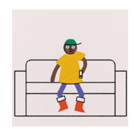
I watch TV.