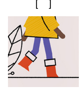
I walk to school.