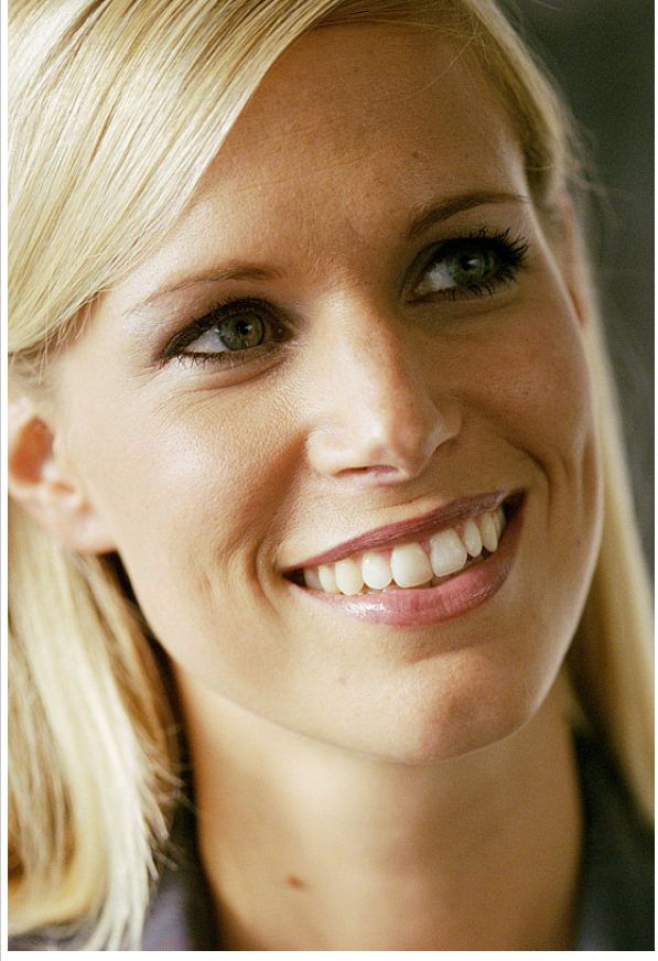
Young woman: Image appears courtesy of Photodisc