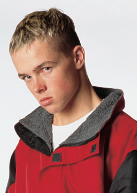
Teenager: Image appears courtesy of Getty