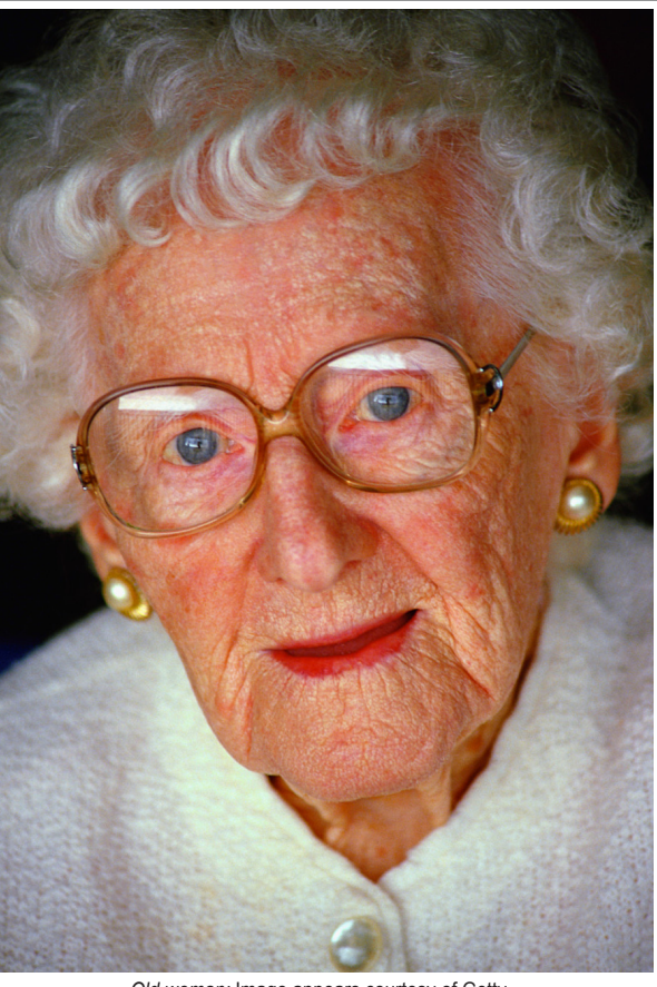
Old woman: Image appears courtesy of Getty