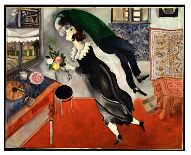
Marc Chagall: Birthday , 1915