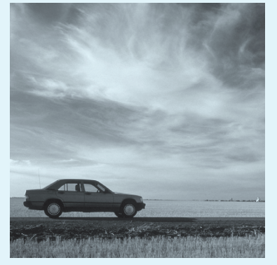
Driving my car