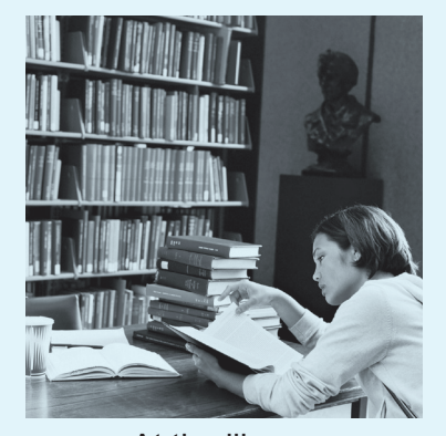
At the library