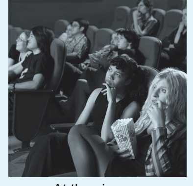
At the cinema