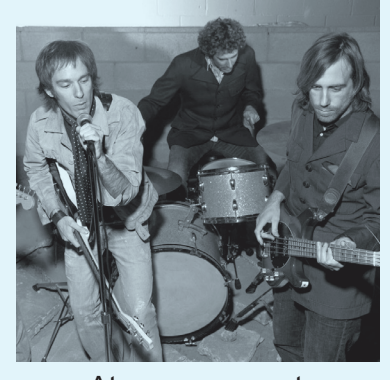
At a pop concert